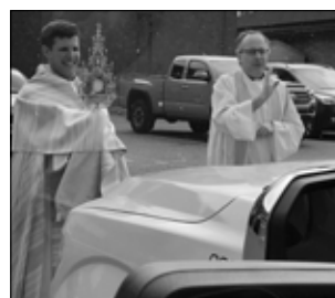
Outdoor Adoration Procession