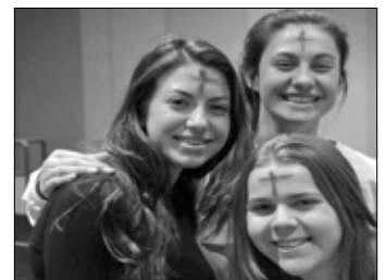
Catholic Campus Ministry- Ash Wednesday