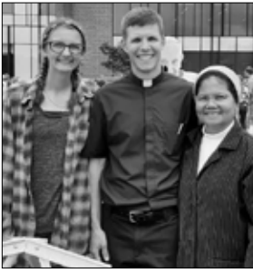
Campus Ministry at NMU Fall Fest