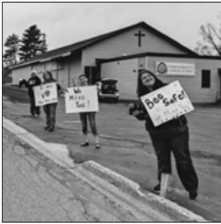
Drive By Parade