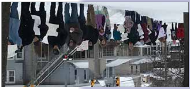
Respect Life Ministry Mini March for Life